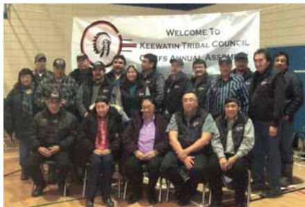
Keewatin Tribal Council Chiefs Annual Assembly, Tataskweyak Cree Nation, MB

For the first time since the Fund began operations in 2008, we participated at the CANDO conference, held this year at Enoch First Nation in Alberta. Opportunities to present our offerings to those involved in economic development ventures proved valuable as we were able to demonstrate the link of these opportunities to market-based housing.