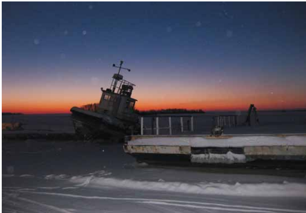
James Bay, northern Ontario

In 2009, many First Nations committed their resources to applying for a portion of the additional housing funds announced as part of Canada's Economic Action Plan (CEAP). The Government of Canada provided $400 million over 2009-10 and 2010-11 to support on-reserve housing. The application procedure was time-sensitive, so ensuring their communities applied on time for CEAP funding became a high priority for First Nation leadership and staff. Now the focus has turned to implementing those projects and ensuring the housing is built and the funding expended as required by Government. In several instances, First Nations reported having to direct their scarce resources to this process and to delay applying to the Fund. The Fund supported these decisions.