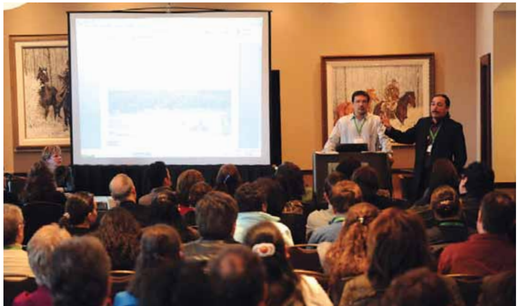
Workshop on good governance including presentation by Long Plain First Nation, MB sponsored by the First Nations Market Housing Fund – Aboriginal Financial Officers Association (AFOA) Conference, Calgary, AB

"Housing by Choice" - it came to us as an appropriate, descriptive theme for our second Annual Report. In so many ways it reflects what happened during the year. Several choices were presented to First Nations, beginning with whether they would choose to invite the Fund into their community to discuss the products, services and benefits the Fund has to offer. For those First Nations who chose to make an application, they determined their priorities and decided how best the Fund could help them meet their housing goals. Each First Nation made choices about the type of loans they wanted to guarantee and the lenders they wanted to work with. For those pursuing capacity building initiatives, they decided how best to meet their needs and in what order to tackle initiatives. The choice will continue as members in communities approved for the Fund's backing decide what type of housing they want to buy or build, or how they wish to improve their current home through renovations.