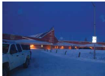
Tataskweyak Cree Nation, MB

Another exciting national event for the Fund was our tradeshow participation at the Canadian Aboriginal Festival held this year in Hamilton, Ontario. As Canada's largest Aboriginal festival, we were again able to meet with many people to discuss how the Fund could work and benefit their First Nation community. Some talked to us about how they would like to move back home, and how they would welcome the option of the Fund.