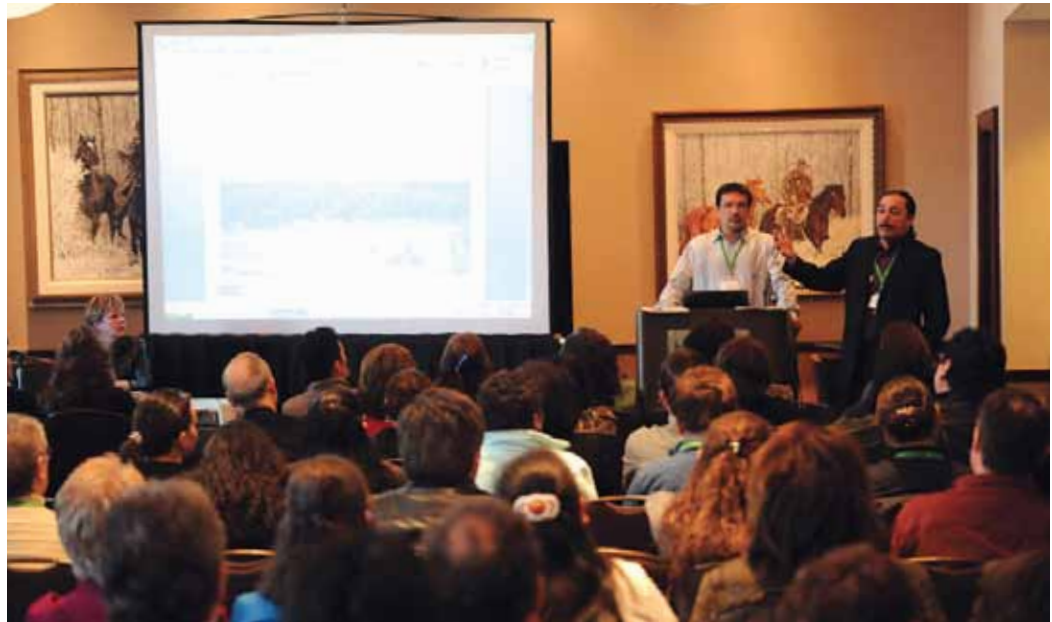
Workshop on good governance including presentation by Long Plain First Nation, MB sponsored by the First Nations Market Housing Fund – Aboriginal Financial Officers Association (AFOA) Conference, Calgary, AB

"Housing by Choice" - it came to us as an appropriate, descriptive theme for our second Annual Report. In so many ways it reflects what happened during the year. Several choices were presented to First Nations, beginning with whether they would choose to invite the Fund into their community to discuss the products, services and benefits the Fund has to offer. For those First Nations who chose to make an application, they determined their priorities and decided how best the Fund could help them meet their housing goals. Each First Nation made choices about the type of loans they wanted to guarantee and the lenders they wanted to work with. For those pursuing capacity building initiatives, they decided how best to meet their needs and in what order to tackle initiatives. The choice will continue as members in communities approved for the Fund's backing decide what type of housing they want to buy or build, or how they wish to improve their current home through renovations.