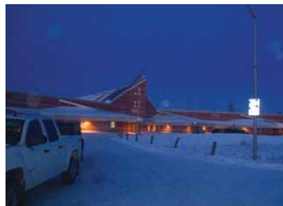
Tataskweyak Cree Nation, MB

Another exciting national event for the Fund was our tradeshow participation at the Canadian Aboriginal Festival held this year in Hamilton, Ontario. As Canada's largest Aboriginal festival, we were again able to meet with many people to discuss how the Fund could work and benefit their First Nation community. Some talked to us about how they would like to move back home, and how they would welcome the option of the Fund.