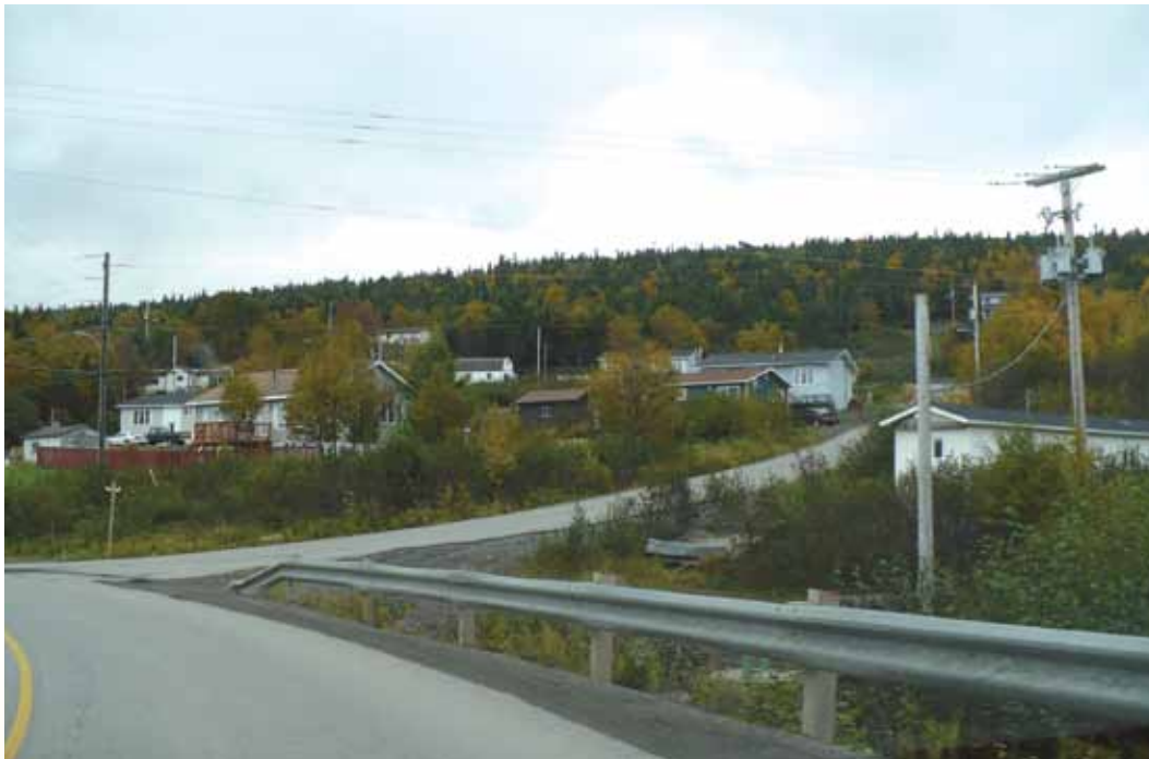
Miawpukek First Nation, NF

Since being established as a reserve in 1987, Miawpukek has gone from a poor, isolated community with almost 90% unemployment, to a strong vibrant community with nearly 100% full time/part-time employment.