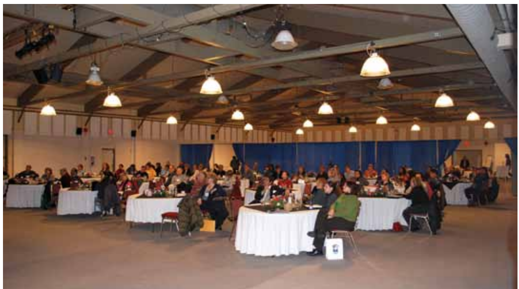
Northern Aboriginal Housing Conference, Whitehorse, YK

Nishnawbe Aski Nation Annual Assembly, Chapleau, ON