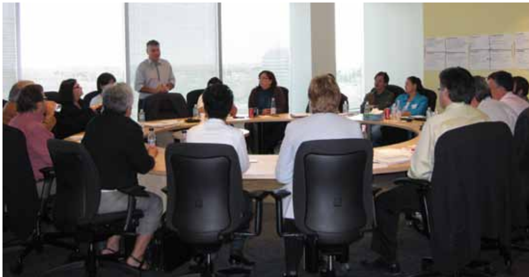
Strategic planning session of the First Nation Market Housing Fund Trustees and Staff