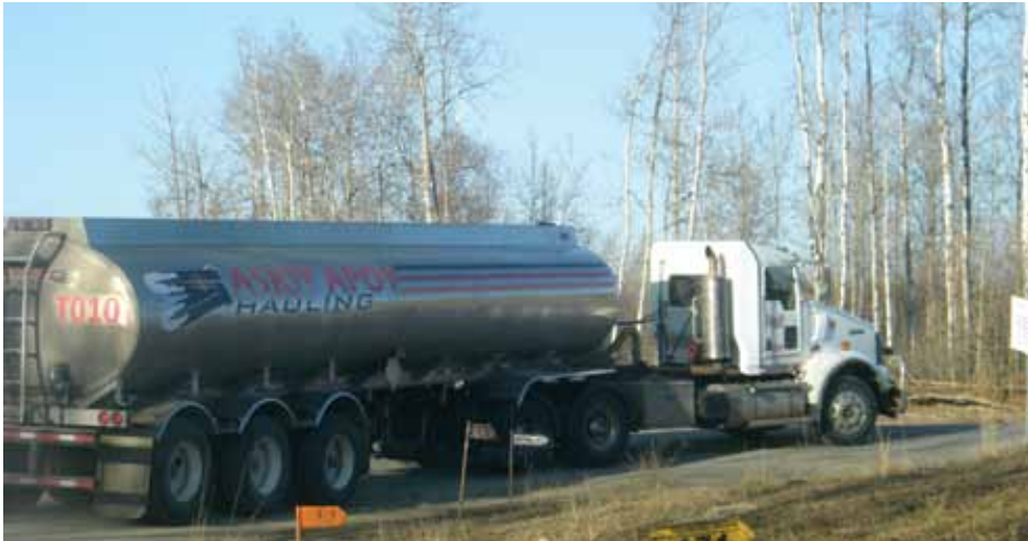
Onion Lake Cree Nation, SK

In addition to partnering with the Fund, Onion Lake has made the commitment to assist members in home renovations and mortgaging homes. As well, OLCN is assisting members wishing to become homeowners by making a capital contribution toward establishing a Home Mortgage Trust and by granting a portion of the down payment for members who qualify for loans through a private lender program.