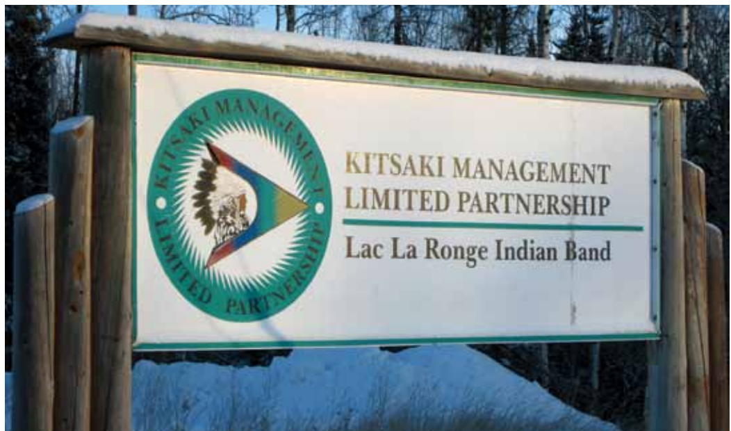
Lac La Ronge Indian Band, SK

Located in north-central Saskatchewan, the Lac La Ronge Indian Band is the largest First Nation in Saskatchewan, and one of the 10 largest in Canada. With a population of approximately 8,800, Lac La Ronge is a multi-community Band with six communities and 18 reserves extending from rich farmlands in central Saskatchewan, north through the boreal forest to the mighty Churchill River and beyond. The communities of Stanley Mission, Grandmother's Bay, and Little Red River are all self-administered, ensuring greater control over the delivery of programs and services. Hall Lake and Sucker River are administered through a central administration office located in La Ronge, 241 km north of Prince Albert, on the edge of the Pre-Cambrian Shield.