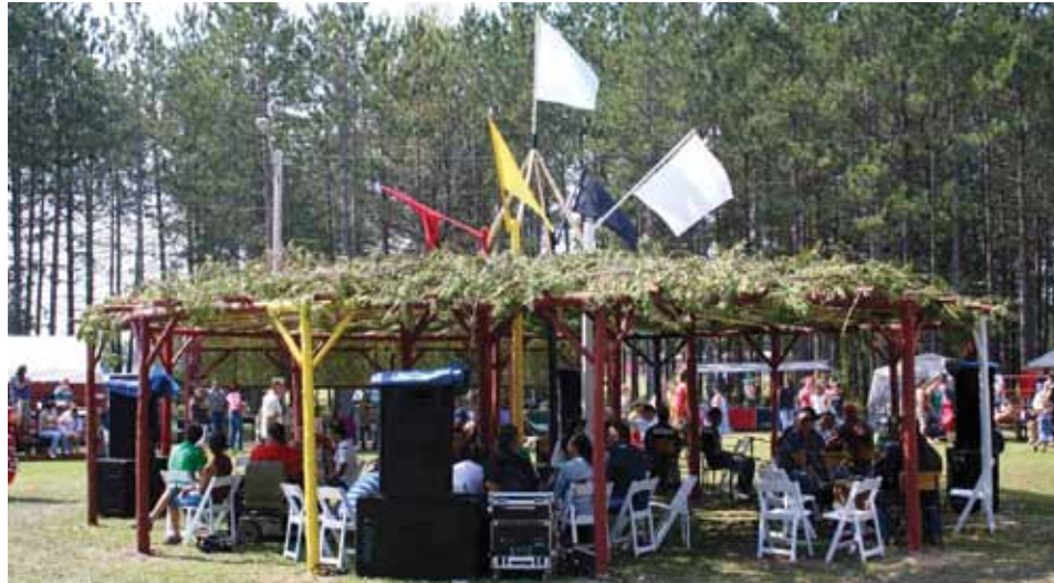
Powwow in Batchewana First Nation, ON

Batchewana First Nation is comprised of four reserve communities: Rankin Reserve, Goulais Bay Reserve, Obadjiwan Reserve, and Whitefish Island Reserve. The administrative offices are located on Rankin Reserve which is bordered on three sides by the city of Sault Ste. Marie. Facilities operated by the First Nation include an Administration/Cultural Centre, Health Centre, Family Crisis Shelter, an Elders' Complex, Day Care, Arena, Youth Centre, Police Station, Gas Bar, Confectionary Store and the Batchewana Learning Centre.