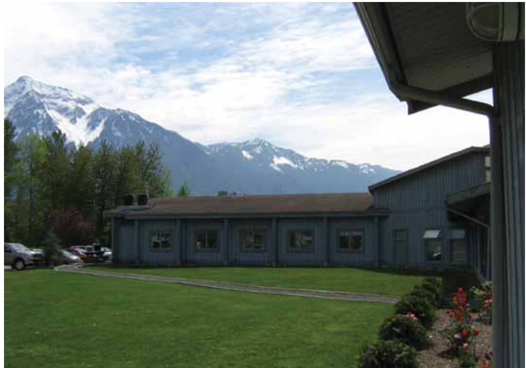
Seabird Island First Nation, BC

Band leadership will use the Fund to train staff and create more home ownership and market-based housing options for their members, who are increasingly able to build and purchase homes using their own income thanks to Seabird Island's diversified economic development activities.