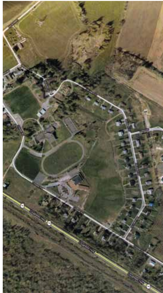
Aerial view of Seabird Island First Nation, BC

Seabird Island First Nation exists to promote a healthier, self-sufficient, self-governing, unified and educated community. Its decisions are guided by a commitment to realize Vision 2020, a strategic multi-year plan to achieve physical, emotional, mental, spiritual and cultural balance for all members of the community.