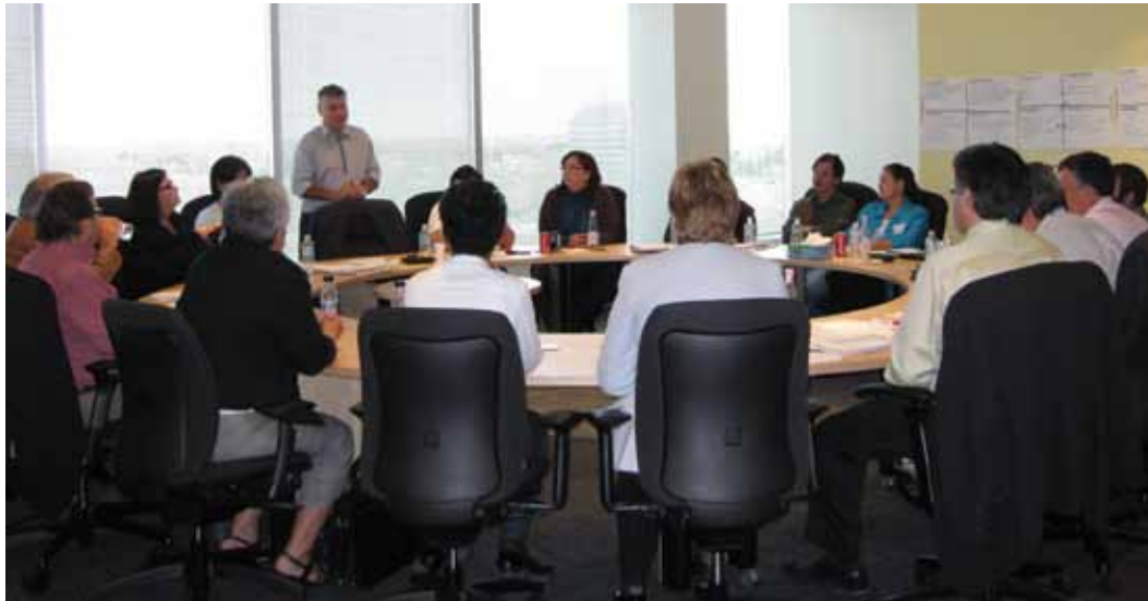
Strategic planning session of the First Nation Market Housing Fund Trustees and Staff