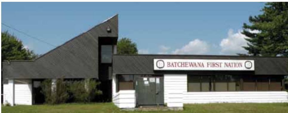
Band office in Batchewana First Nation, ON

The Batchewana First Nation of Ojibways is located on the north-eastern corner of Lake Superior and the St. Mary's River area adjacent to the City of Sault Ste. Marie, Ontario. The First Nation has a total population of 2,400, approximately 72% of whom reside off-reserve.